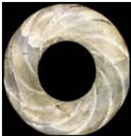
The spiral-patterned ring is 27 mm in diameter and was probably a body ornament

475 BC. Most archaeological attention has focused on larger and more spectacular jade and bronze artifacts. But Lu identified the patterns on the small rings as Archimedes' spirals, which he believes are the oldest evidence of compound machines.